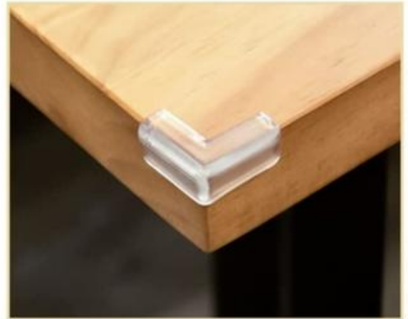
4.Clean the corner to make sure