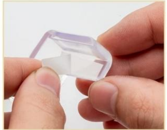
2.Paste the adhesive on the Corner guard