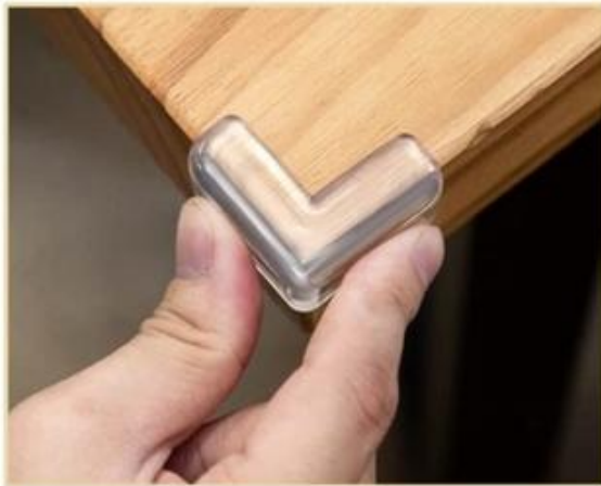
3.Paste and press