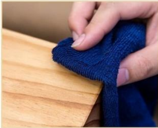
1.Clean the location you need to paste