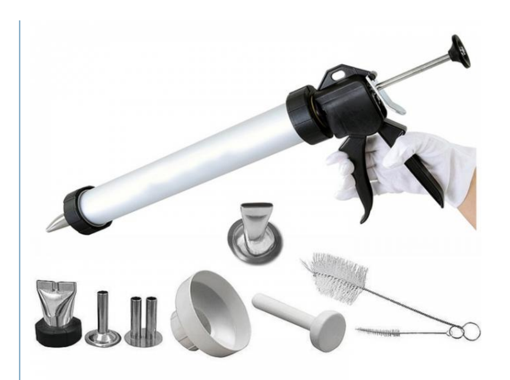
Jerky Gun-All Plastic Stomper