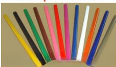
colourful glue sticks