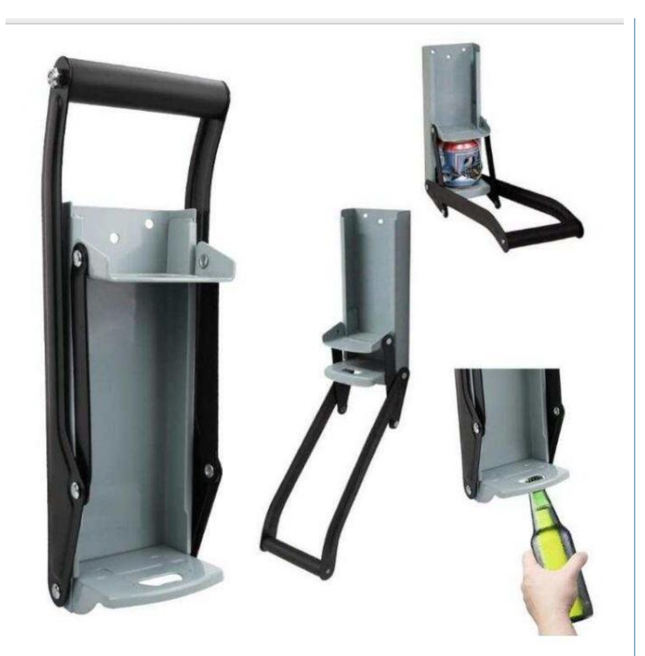
Colors we can make black,grey,blue, red, yellow,orange, purple,green and other colors