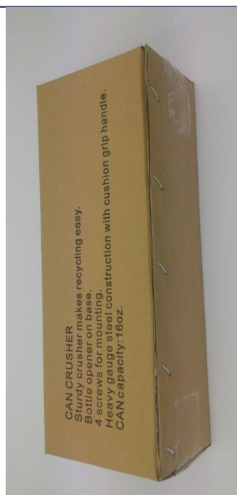
brown postage box