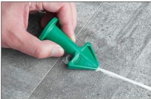
Nozzle Plus can be used alone as trowel