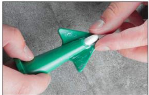
Scrap an be easy to take out after solidity