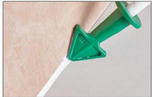
Tow the Nozzle plus backward