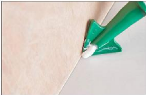
Pushing silicone caulking gun smoothly