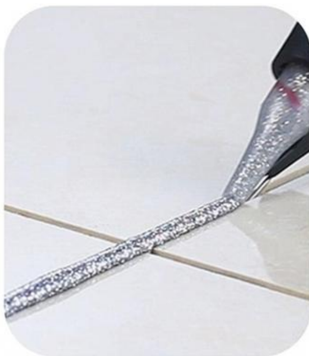
After installing the locator