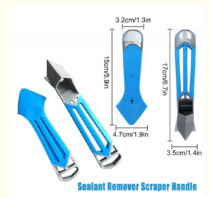
Sealant Remover Scraper Handle