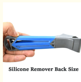
Silicone Remover Back Size