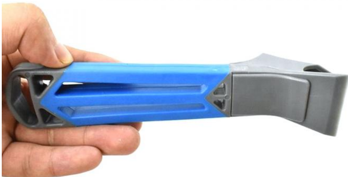
Silicone Remover Back Size