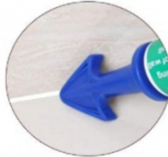
Tow The Nozzle Plus Backward