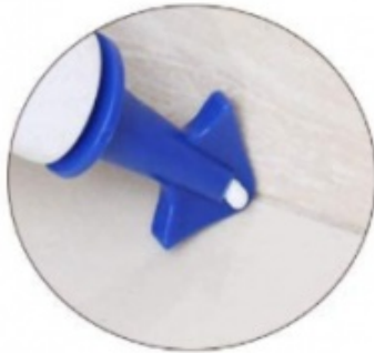
Pushing Silicone Caulking Gun Smoothly