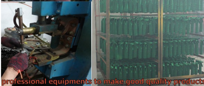
professional equipments to make good quality products

Hangzhou Hachi Technology is a leading manufacturer and professional exporter of building tools in China. Hachi Technology was a family enterprise and has been in this line for more than 10 years with many experience. With the professional working team, specialized workers, strictly qual