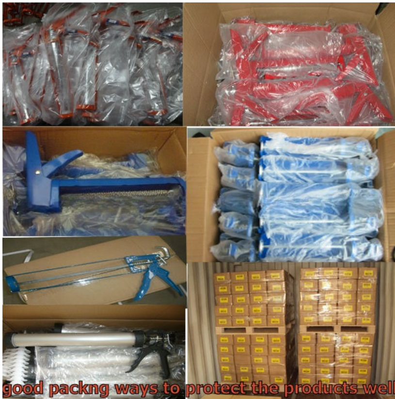
good packing ways to protect the products well