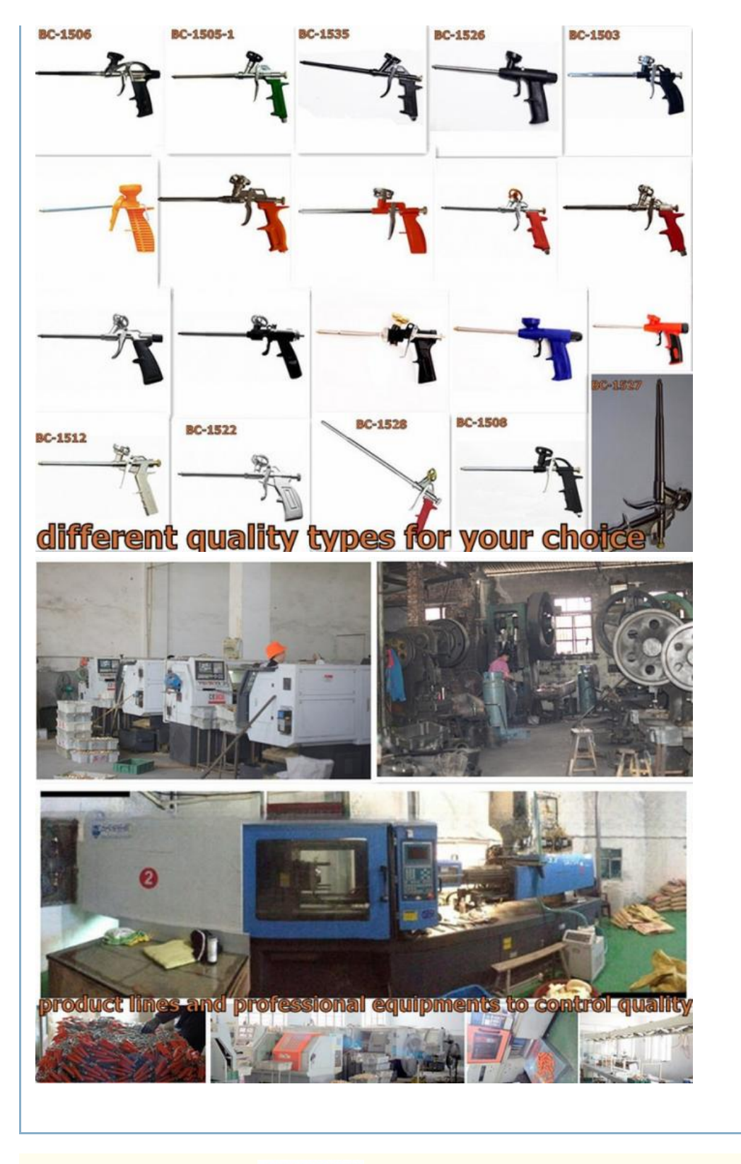
TOOLSBUDDY HANGZHOU HAISHI TOOLS CO., LTD

+86-13429626426 info@sealantgun.com 📀 sealantgun.com