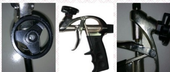
teflon coated adapter