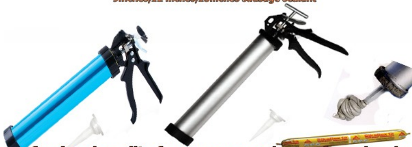
professional quality for sausage sealant soft pack using