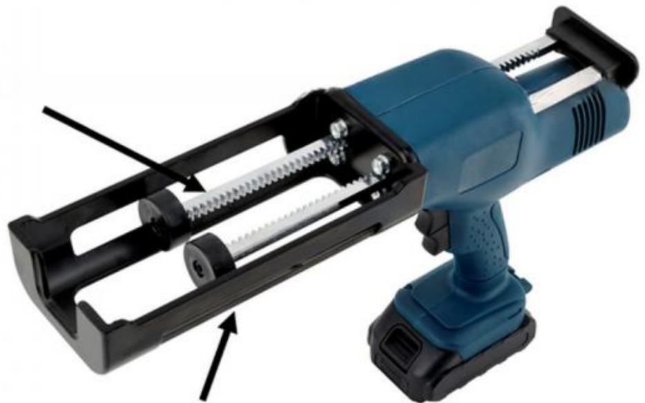
Aluminum Alloy Rubber Holder