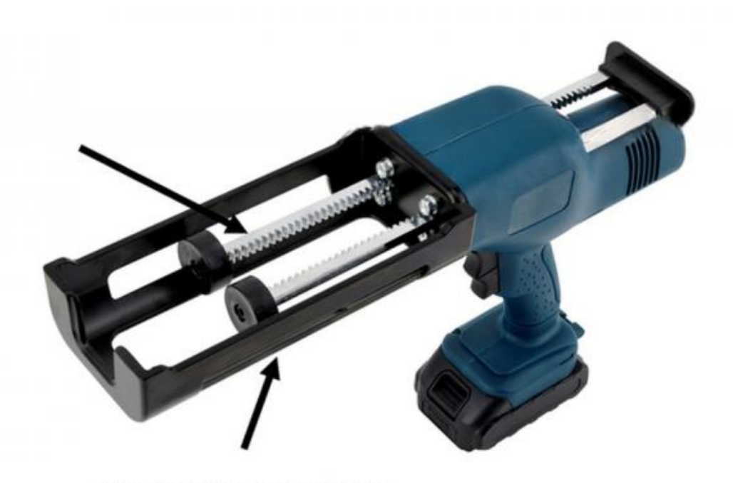
Aluminum Alloy Rubber Holder