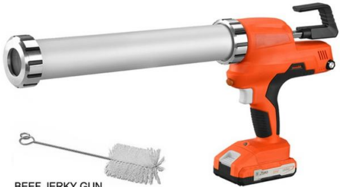
BEEF JERKY GUN